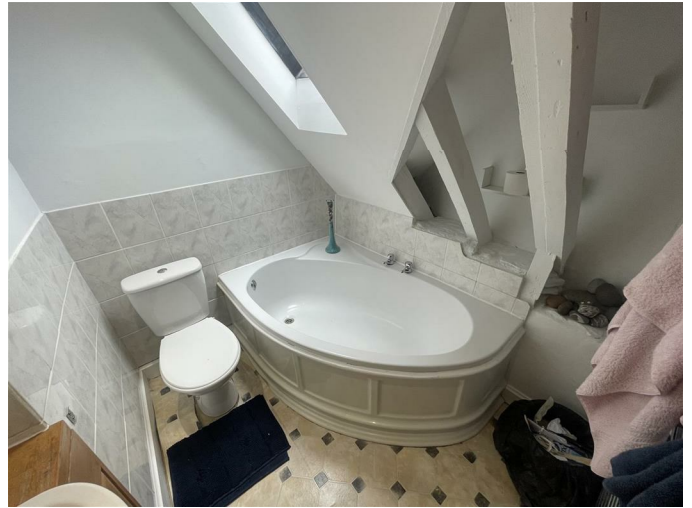
Bathroom 6'07 x 6'03 (2.01m x 1.91m)