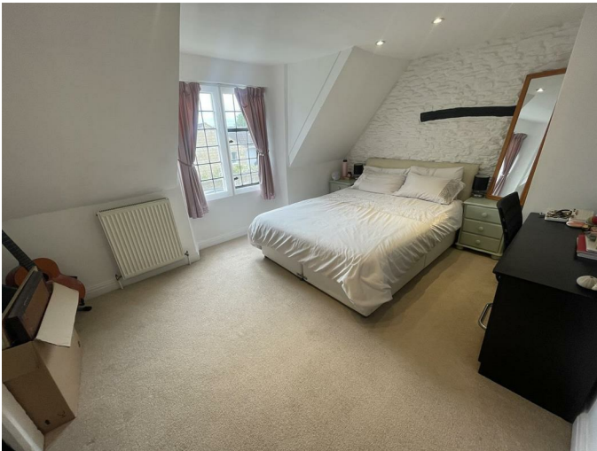
Bedroom Two 14' x 10'04 (4.27m x 3.15m)