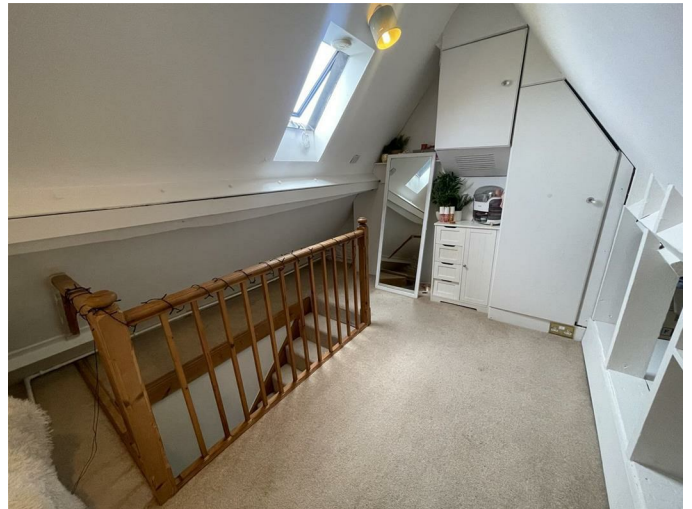
Second Floor Bedroom Four 13'04 x 11'02 (4.06m x 3.40m)