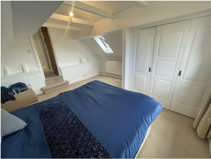
Bedroom One 13'08 x 13'04 (4.17m x 4.06m)